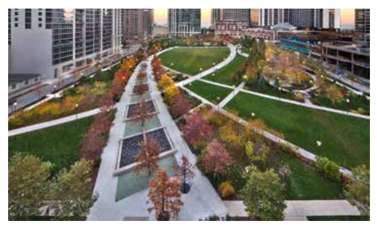
The Park at Lakeshore East, Chicago, IL

OJB has also had a considerable impact in the design of urban and public spaces. OJB believes that landscape and open space are critical to rejuvenating and revitalizing cities and can stimulate economic development and urban growth. Cities are increasingly aware of the importance of providing the urban core with well programmed, beautiful open spaces to attract and retain residents and businesses. OJB's public park projects – including Lakeshore East in Chicago and Klyde Warren Park in Dallas raised the bar for urban open space design. In fact, the Landscape Architecture Foundation